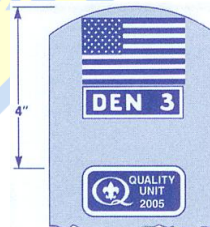
TIGER CUB, CUB SCOUT OR WEBELOS SCOUT RIGHT SLEEVE