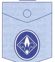
WEBELOS SCOUT LEFT POCKET (TAN SHIRT)